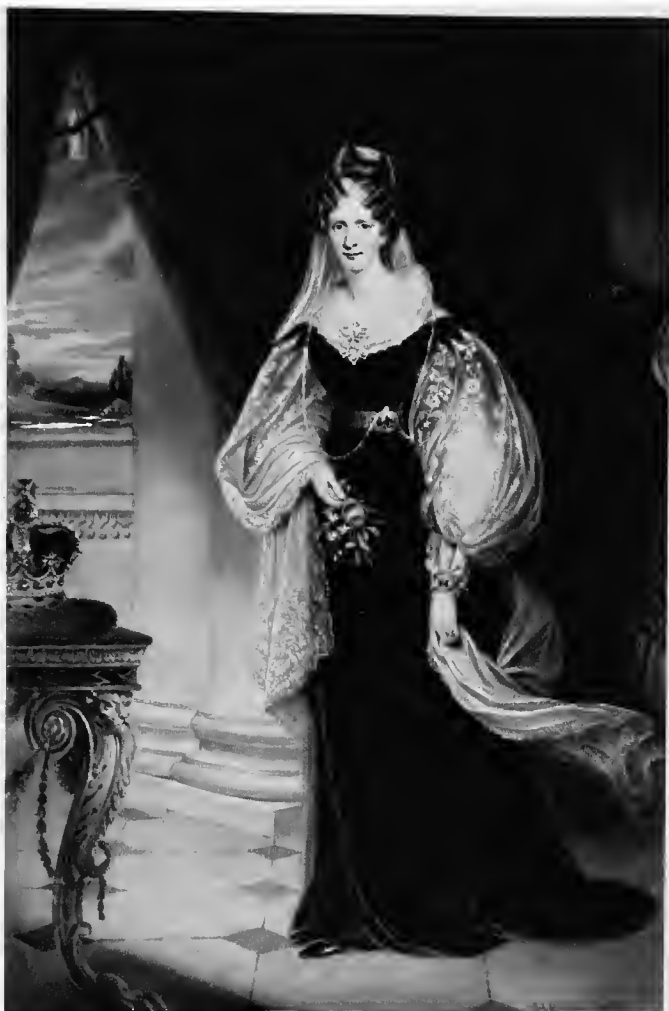
H. M. Queen Adelaide 1832